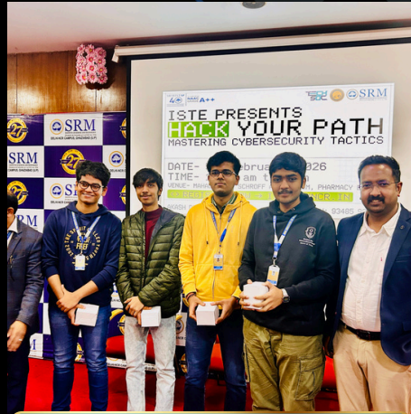
SRM Institute of Science and Technology