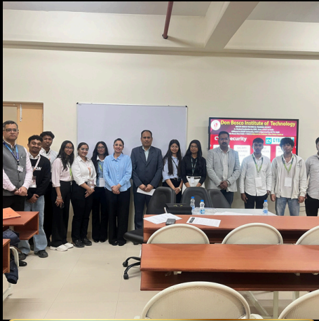
Don Bosco Institute of Technology