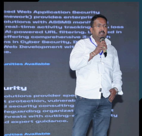
Hack Defence Summit 2026