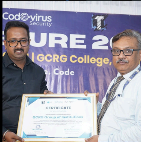
G.C.R.G. Group of Institutions, Lucknow