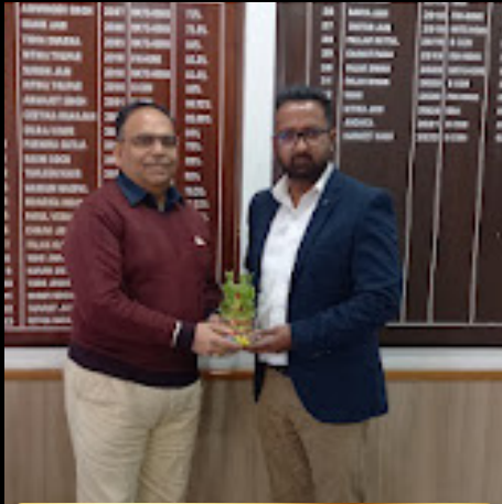
Shri Aurobindo College, of commerce and management