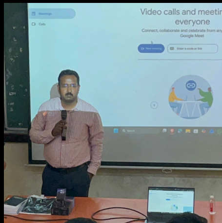
Daulat Ram College, DU