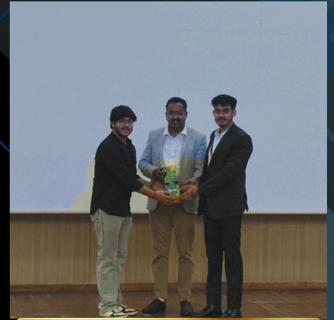
Indraprastha Institute of Information Technology Delhi