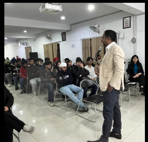
Shri Guru Tegh Bahadur Institute of management & Information technology (SGTBIMIT)