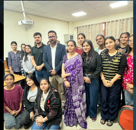
Maitreyi College, University of Delhi