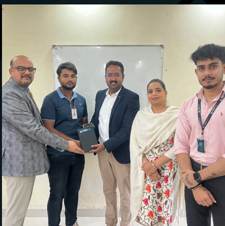
IIMT Group Of Colleges Greater Noida