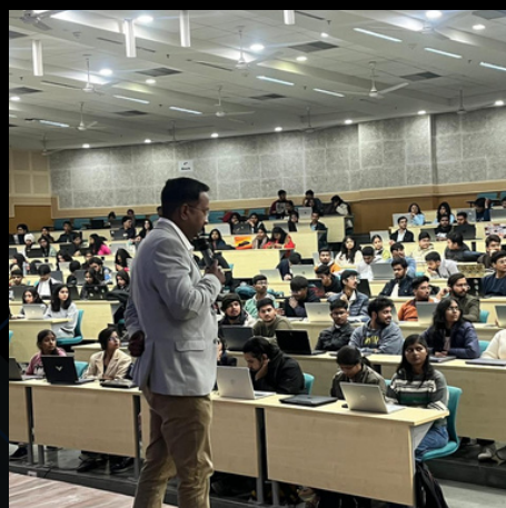
Indraprastha Institute of Information Technology Delhi