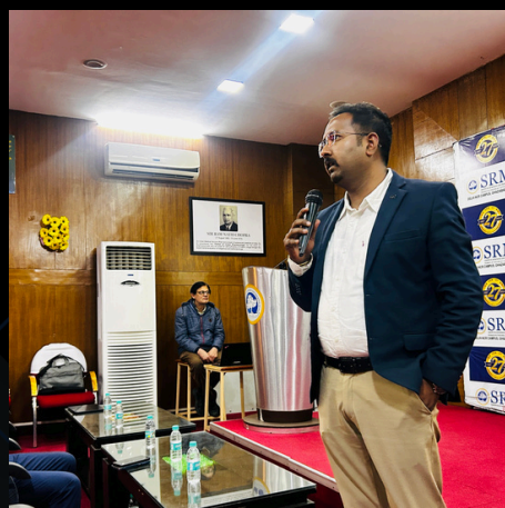
SRM Institute of Science and Technology