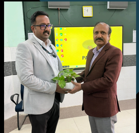
CM SHRI SEC-19 DWARKA