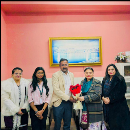
Shri Guru Tegh Bahadur Institute of Management & Information Technology (SGTBIMIT)