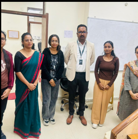
Maitreyi College, University of Delhi