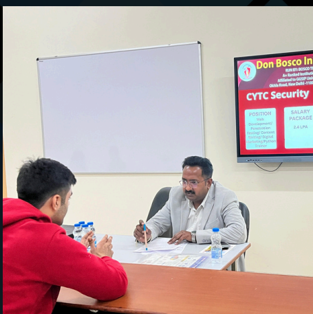
Don Bosco Institute of Technology